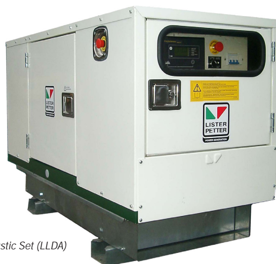
Acoustic Set (LLDA)